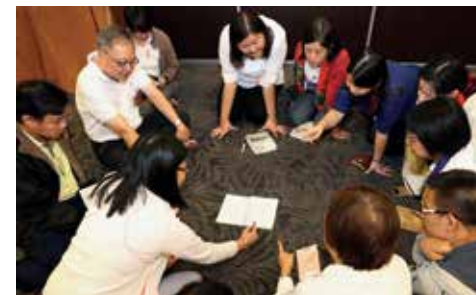
Teachers enjoying great camaraderie while doing group assignments and having discussions.