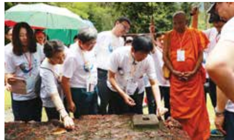
The study tour on 16 September was remarkably enriching, and revealed an invaluable treasure trove of Buddhist heritage in Malaysia.