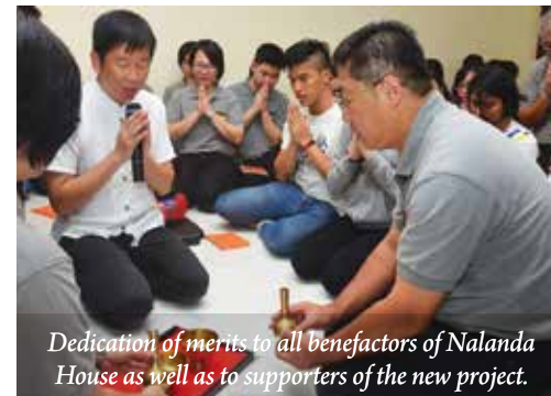
Dedication of merits to all benefactors of Nalanda House as well as to supporters of the new project.