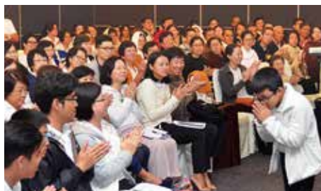
Nalanda students were invited to share their experience about Dhamma School in a forum.