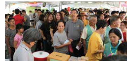
8.00 am - Start of the Fun Fair! And the crowd continued to stream in throughout the day.