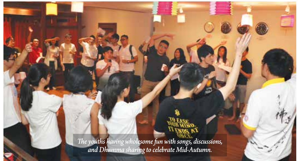
The youths having wholesome fun with songs, discussions, and Dhamma sharing to celebrate Mid-Autumn.