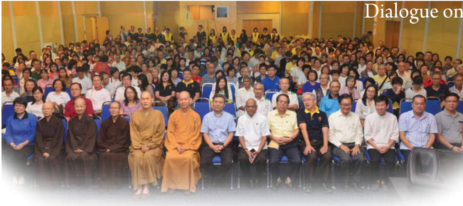
450 people, mainly English-speaking devotees from the Klang Valley, participated in the seminar.