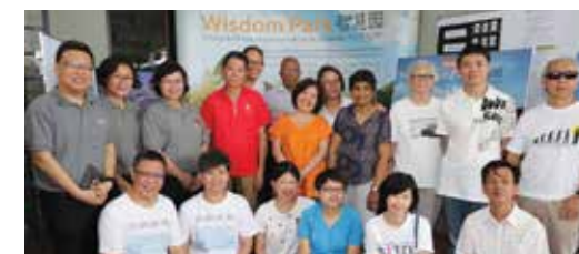
Our remarkable friends from Singapore! Thank you for lending us your support.