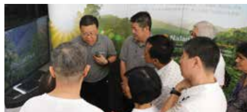
A corner of NEO Centre was dedicated to sharing with visitors about 'Wisdom Park'.