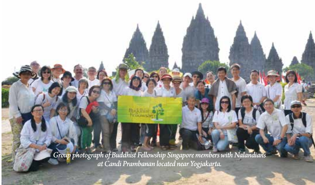
Group photograph of Buddhist Fellowship Singapore members with Nalandians at Candi Prambanan located near Yogyakarta.

We rejoice in their learning and wish that many others will benefit from such study tours in the future. Sadhu anumodana!