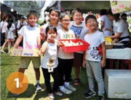
1 Children getting creative with mobile sales around the Fair.