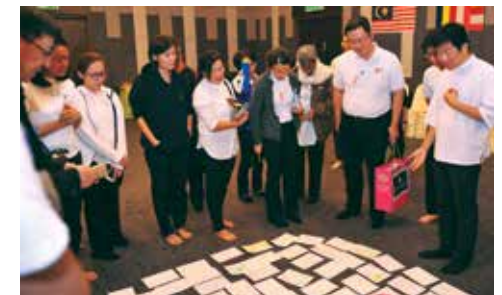
Admiring drawings by participants on their initial motivation to teach Dhamma.