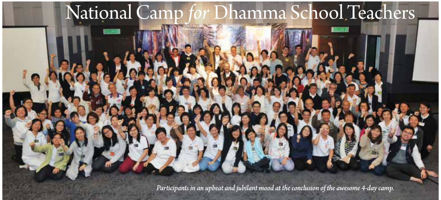
Participants in an upbeat and jubilant mood at the conclusion of the awesome 4-day camp.