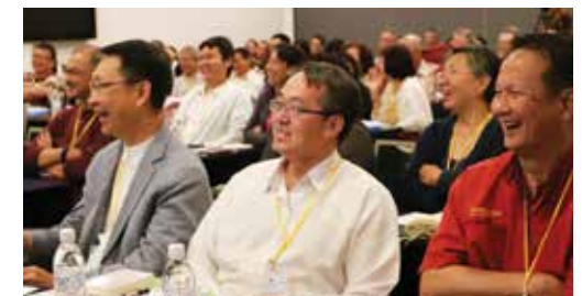
The 3-day conference passed quickly with a lot of informative presentations and great camaraderie among participants.