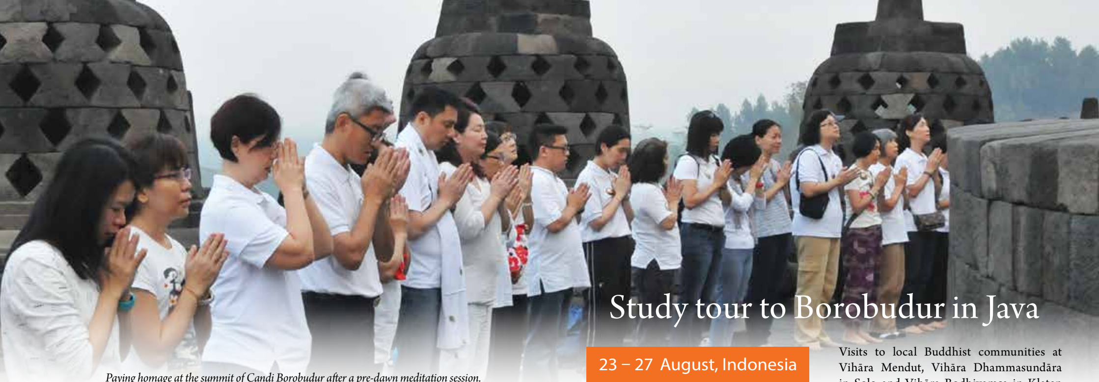
Paying homage at the summit of Candi Borobudur after a pre-dawn meditation session.