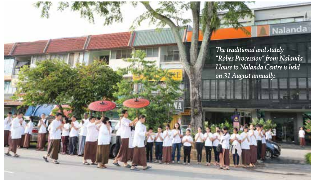
The traditional and stately "Robes Procession" from Nalanda House to Nalanda Centre is held on 31 August annually.