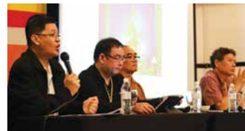
Panel discussion on the historical development of Chinese Buddhism, Theravāda, and Vajrayana Schools in Malaysia, held on the last day of Conference.