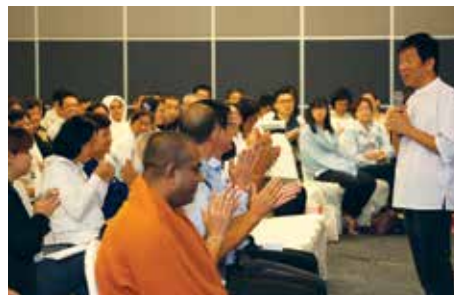
There was much rejoicing and appreciation for the teaching and learning at the insightful camp.