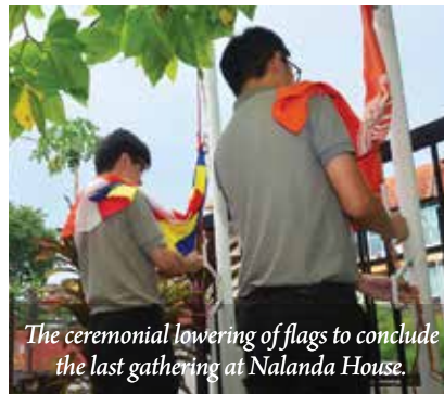
The ceremonial lowering of flags to conclude the last gathering at Nalanda House.