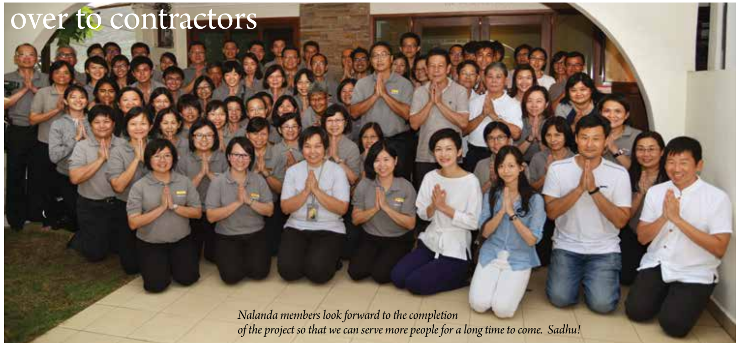
Nalanda members look forward to the completion of the project so that we can serve more people for a long time to come. Sadhu!

We urge the community to help us raise funds for this vital project for the Dhamma education of our present and future generations. While this meritorious project is in progress, let us all generate good thoughts that the construction will progress smoothly, safely, and successfully. Sadhu! [ See its progress on Pages 30–31. ]