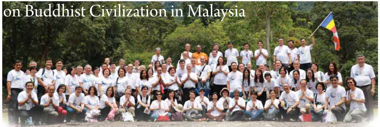
Participants of the National Conference gathered for three days in Central Kedah to explore the rich Buddhist heritage in northern Malaysia.

This Conference was part of a grand celebration billed the ‘Malaysian Buddhist Festival’ (MBF) to mark our nation’s ‘Diamond Jubilee’. The joint organisers of this festival include Malaysian Buddhist Association (MBA), Theravāda Buddhist Council, Vajrayana Buddhist Council, Fo Guang Shan (佛光山) Malaysia, and Selangor Buddhist Development Council. A series of religious, cultural, and academic programmes have been lined up under MBF until 2018, which will be held in several states around the country.