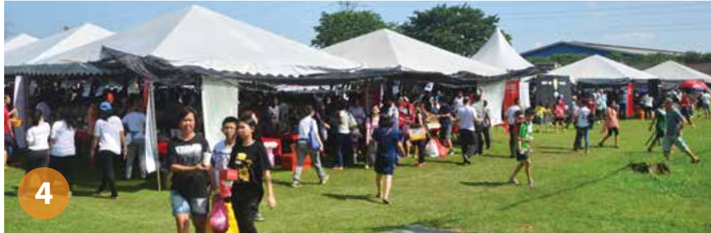
4 The sunny weather encouraged a good turnout for the Fun Fair.