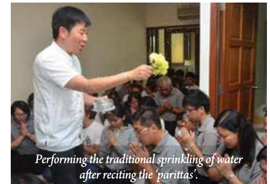
Performing the traditional sprinkling of water after reciting the 'parittas'.